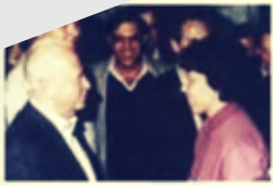
以色列总理拉宾接见萨拉，1994年 Sara received by Yitzhak Rabin, Prime Minister of Israel, 1994